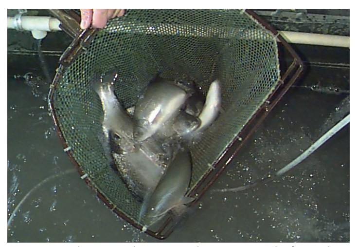
Figure 3. Rainbow trout about 1 pound in size in March after stocking in November in a Georgia pond.

Fish for sport fish ponds should not be obtained from public lakes or streams. Wild fish may not be as adaptable to small static-water ponds as domesticated hatchery fish. Disease organisms may be found on any fish, but are more likely to be carried by wild fish. Transfer of diseased fish from one body of water to another is not legal in Georgia.