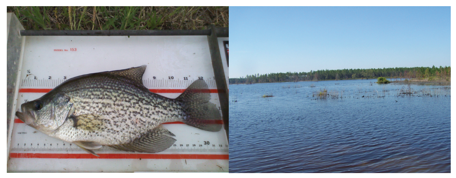
Figure 5. Crappie caught from a large 300-acre pond with clear water and room for multiple species.

bluegill ponds. For these reasons, a large pond is the best place for crappie (Figure 5) and successful populations can be found in unfertilized ponds with clear water.