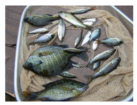
Figure 1. A sample of forage for largemouth bass showing several sizes of bluegill sunfish, threadfin shad, shiners, and small largemouth bass.

Consider your goals for fish production and fishing preferences when choosing a fish stocking program. Balance can be managed for combinations of largemouth bass, sunfish, and channel catfish. Other species can be added as forage fish for the bass, but adding fish species that compete with the bass or sunfish can change the balance in a negative way. The initial stocking rates should consider your fertilization and feeding plans. More fish can be stocked when a routine fertilization schedule is followed than when a pond is not fertilized. High stocking rates and pond fertilization lead to the necessity of frequent fishing to harvest a higher fish production than when lower stocking rates are used.