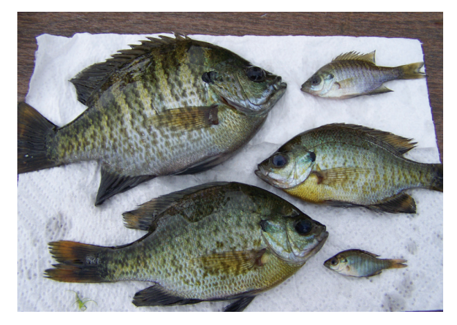
Figure 9. Mixed bluegill sizes showing a balance between older and younger fish, so that largemouth bass of all sizes have forage.

Bream serve as the forage base for largemouth bass and must be managed to provide enough food for bass growth but not allowed to overpopulate and stunt their own growth. Bream must be removed on a regular basis from the pond, either by the bass or by anglers. Set goals for bream fishing based on Table 3 and monitor the size of bream caught. It has been said, "Never return bream to the pond, regardless of size." In overcrowded bream ponds, a bluegill may be only 3 inches long, but fully mature. Removal of intermediate sized bream, between 4 and 6 inches long, will encourage growth of the larger bream to trophy size (Figure 9).