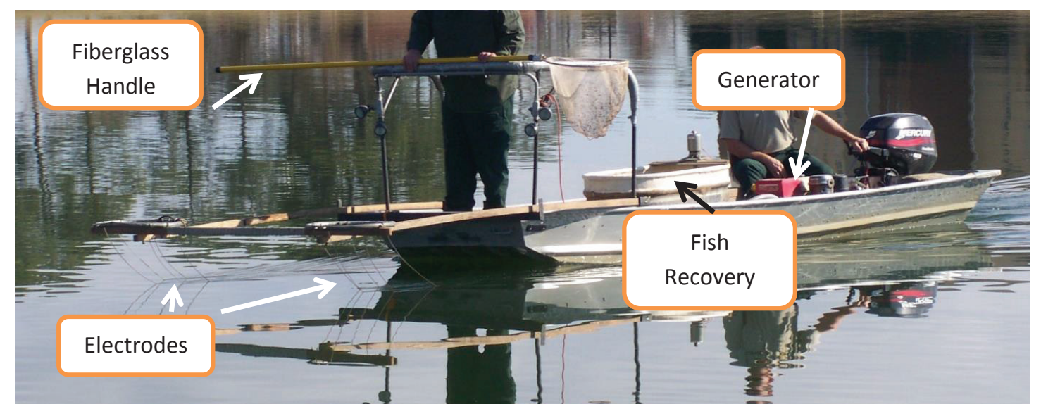
Figure 12. Electro-fishing equipment used to check pond balance or relocate fish.

The weight of a fish relative to a standard weight shows if the fish is getting enough to eat or not. The condition of a fish can indicate the balance between that fish and other fish in the pond of its own species and predator or prey species. For example, if a bass is thin, there may be too many bass and too few bream. Use the tables 5, 6, and 7 to compare standard weights to the weight of fish caught from a pond. If the weight is within 90 percent of the standard weight, conditions are okay. If the fish are 80 percent or less of the standard weight, improvements should be made to correct the pond management system. Catch bass to remove completion and increase bass weight, or add more forage to improve bass nutrition. Stunted bream populations may require pond renovation.