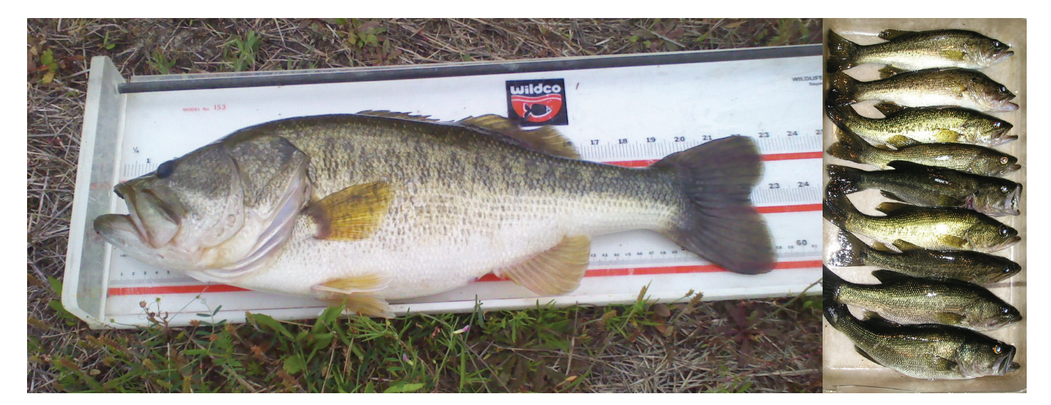
Figure 10. Largemouth bass in good condition on left and stunted on right.