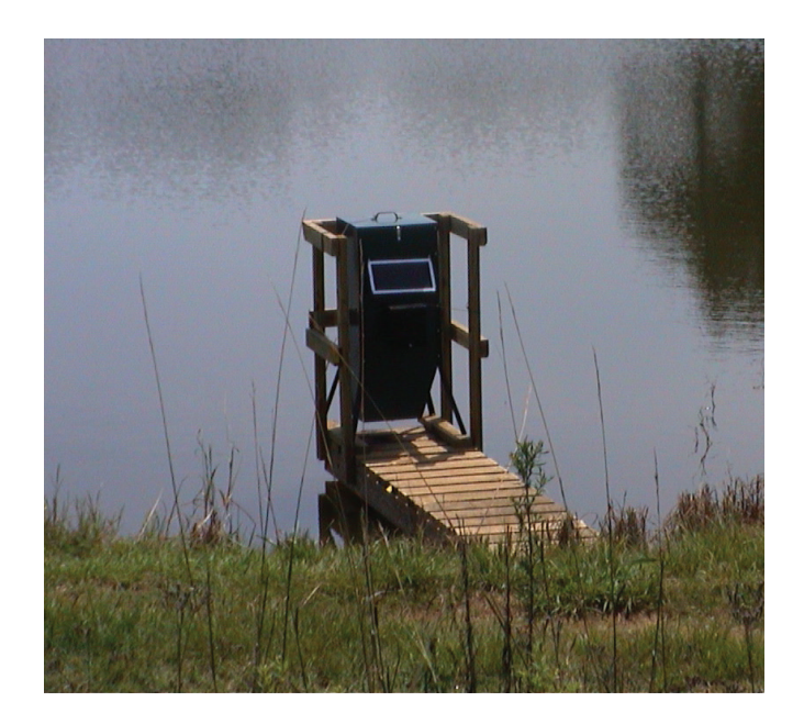
Figure 8. A fish feeder, placed on a dock for easy access, is activated by a timer and solar powered.

Supplemental feeding can improve bream growth under certain conditions, but do not think that all bass-bream ponds must be fed. Bluegill sunfish have been grown to over 1 pound in size by using supplemental feeding. A high quality fish feed of 1/8- to 1/4-inch diameter should be used to feed bream. The feed should also contain between 32 percent and 36 percent protein. As with catfish, feed what the fish will consume in less than 15 to 20 minutes. However, bream are not fed in the same manner as commercial fish farms that feed high densities of fish. Special feed formulations (sport fish diets) are used as a supplemental ration for bream. Automatic feeders (Figure 8) can be used to ensure regular feeding and allow several feedings per day. Hybrid sunfish will also benefit from supplemental feed. However, stunted bream populations cannot be improved by using supplemental feeding. Other methods for correcting bream overcrowding will be explained in the section on fishing methods.