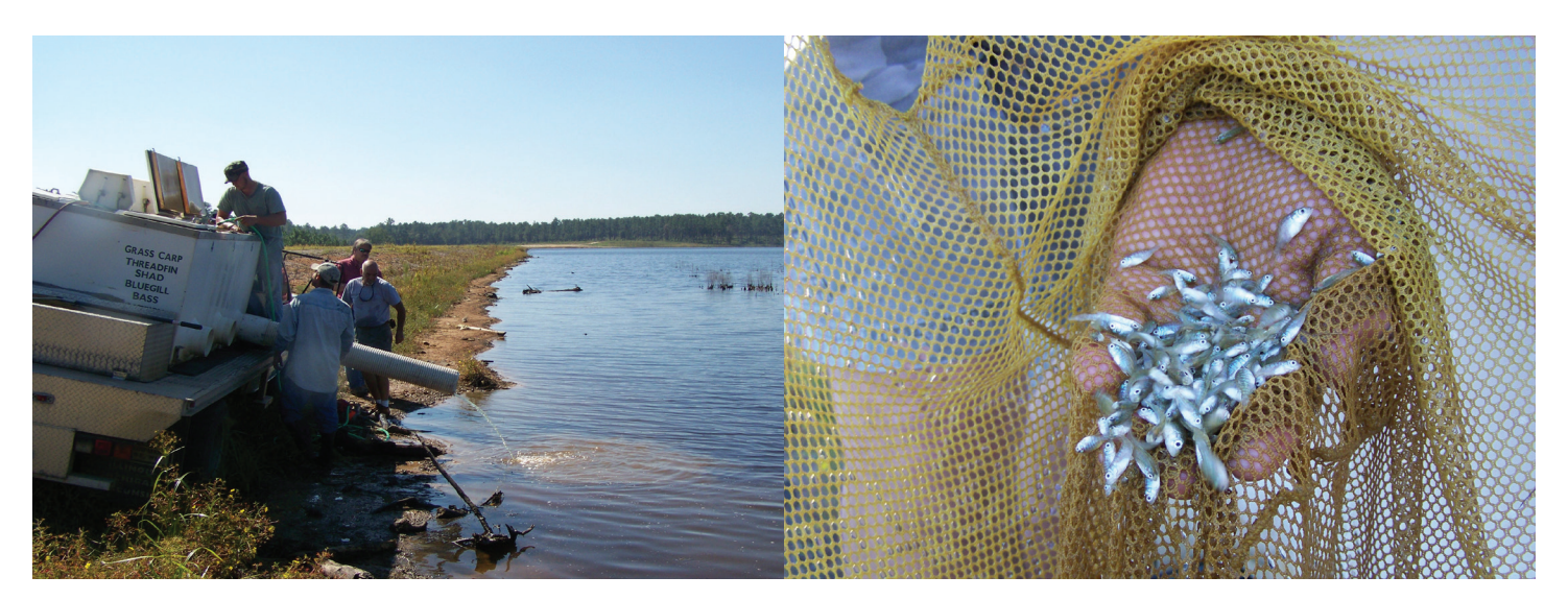
Figure 2. Stocking a pond with 1- to 2-inch bluegill in the fall.

Fish should be tempered or acclimated to the receiving pond water before unloading in order to avoid adding stress to the transport experience. Change water temperature to match the receiving water at the rate of 10 degrees Fahrenheit over 20 minutes. Transfer the receiving water into the hauling tank by bucket or pump, and measure the temperature change with a thermometer. Cool weather and water reduce the possibilities of transport stress of fish.