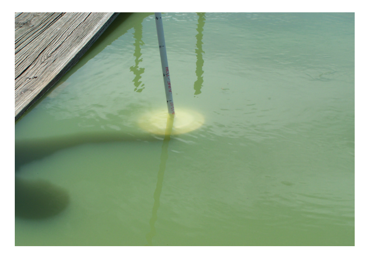
Figure 6. Using a white target on a stick to measure light penetration into pond water. The best range of light penetration is between 12 and 18 inches when using a pond fertilization program.

Fertilization will increase the amount of plant growth in a pond and should cause a bloom of phytoplankton (microscopic algae). Normal blooms allow visibility of 12 to 18 inches into the pond water, using a Secchi disc or light colored object (Figure 6) held downward into the water. Phytoplankton and bacteria grow on the fertilizer nutrients and, in turn, feed zooplankton (microscopic animals). Zooplankton is a food for young fish and filter feeding fish, which provide the forage base for largemouth bass. In this way, inorganic nutrients in fertilizer are converted into extra fish mass.